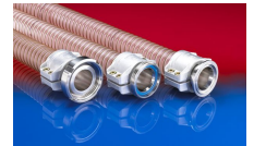
CONNECT SAFETY CLAMP ASSEMBLY 231