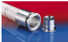
CONNECT PRESS ASSEMBLY 232