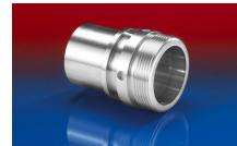
CONNECT THREAD FITTING 234