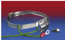
CLAMP 212 EC