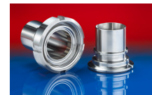
CONNECT ASEPTIC FITTING 249