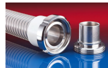
CONNECT MOULD ASSEMBLY 233