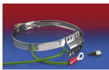
CLAMP 212 EC