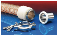
CONNECT TRI- CLAMP FITTING 245