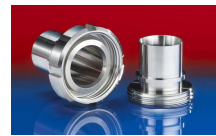
CONNECT DAIRY FITTING 247