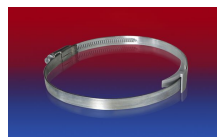
CLAMP 210 BRIDGE CLAMP