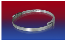
CLAMP 210 BRIDGE CLAMP