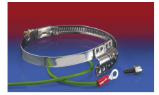
CLAMP 212 EC