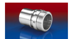
CONNECT THREAD FITTING 234

Overpressure and underpressure are recommended threshold operating values, products can be subjected to higher loads upon request. The bending radius is measured through the inside of the hose arch. The right to make technical modifications is reserved. All values determined at 20°C and are approx. data. Additional information at www.norres.com/en/technology/ .