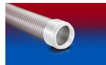
CONNECT 245 FOOD