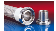
CONNECT MOULD ASSEMBLY 233