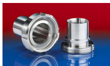
CONNECT DAIRY FITTING 247