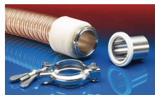
CONNECT TRI-CLAMP FITTING 245