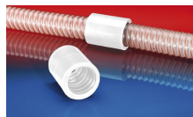
CONNECT 246 FOOD