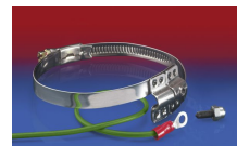
CLAMP 212 EC