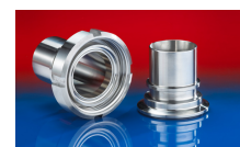
CONNECT ASEPTIC FITTING 249