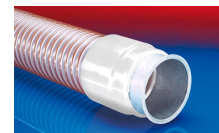
CONNECT 243 FOOD